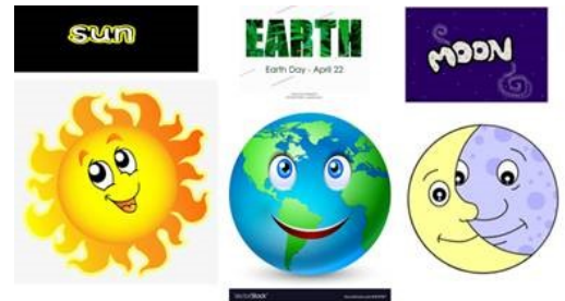
In Orange Class, Rebecca has been busy learning about space.