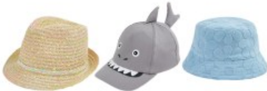
Sun Hat (hot weather)