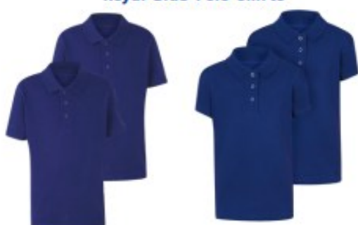
Royal Blue Polo Shirts