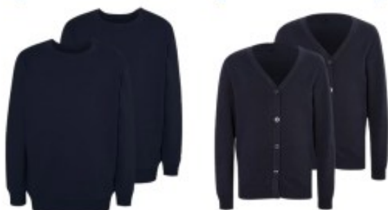
Navy Blue Sweatshirt, Cardigan, Fleece or Jumper