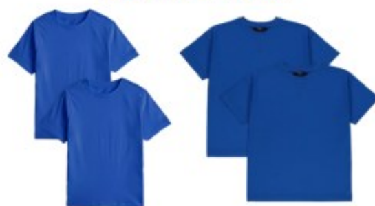
Royal Blue PE T-Shirts