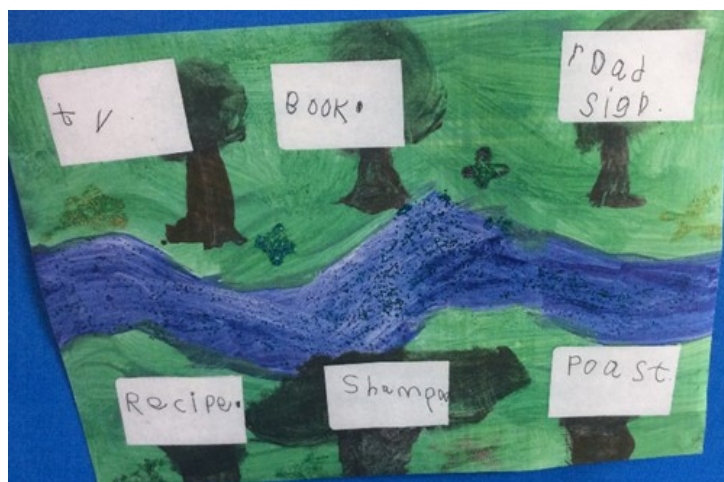
Red Class - Phoebe