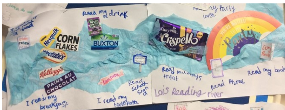
Draw for Blue Class - Lois