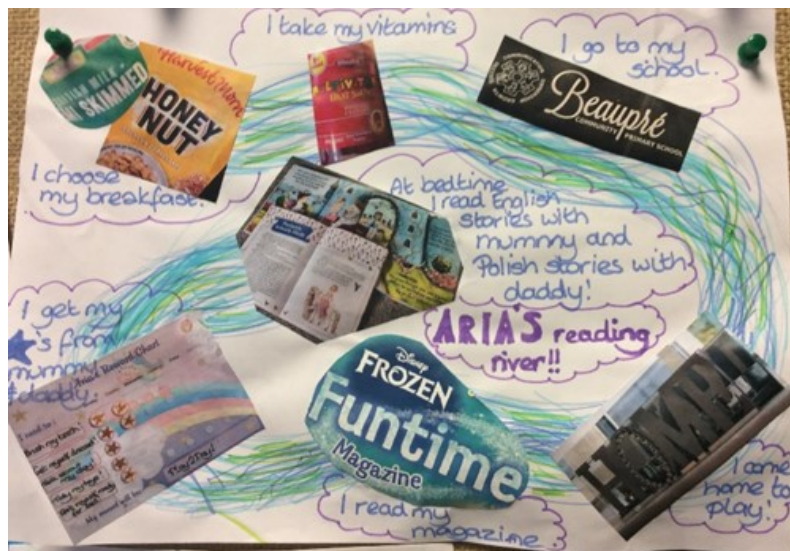
Rainbow Class - Aria

After much consideration and debate, due to the high standard of all entries, are pleased and proud to announce the winners from each class.