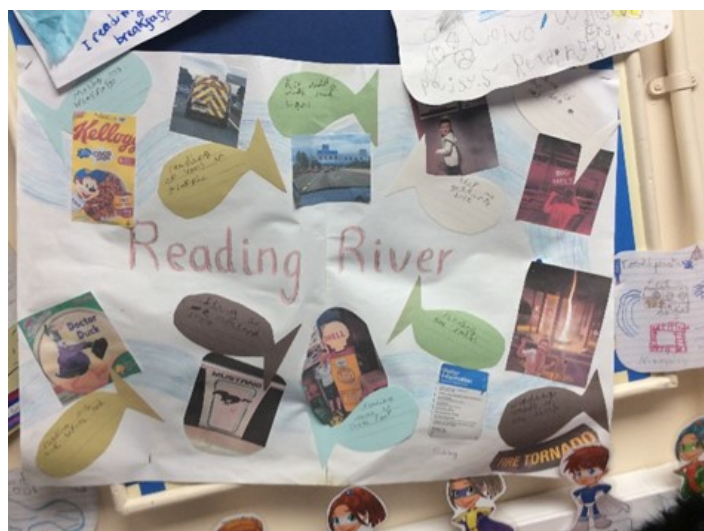
Draw for Blue Class - Sidney